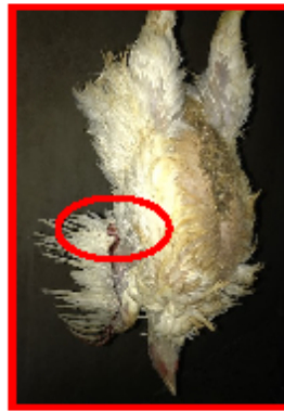
Fail (broken or dislocated bone is visible (circle); abnormal wing posture)