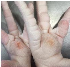
Pass (paws with no cuticle and normal skin color)