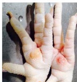
Pass (paws with no cuticle & some color variation, healed skin and no ulcerations)