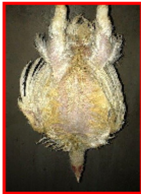
Pass (normal wing posture with wings tucked close to body)