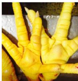
Pass (washed paws with no lesions & normal skin color)