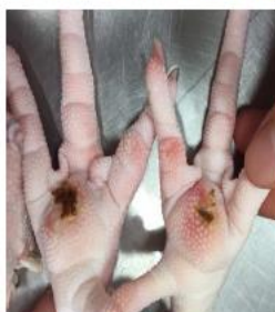
Pass (washed, post-scald paws with scab covering less than 1/2 the area of the foot pad)