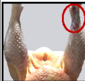
Fail (drumstick with bruise > quarter size)