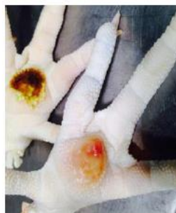
Fail (paws without cuticle) Ulceration is present and the lesion is more than 1/2 the area of the foot pad. Swelling of the foot pad is also visible.