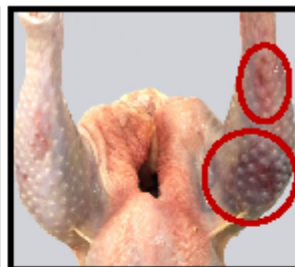
Fail (drumstick with various bruises covering > quarter size)

Note: If both legs are injured on one bird, this counts as one 'leg injury failure' for auditing purposes.