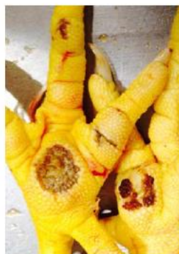
Fail (washed paws) Ulceration is present and lesion is more than 1/2 the area of the foot pad; lesions are also present on the toes