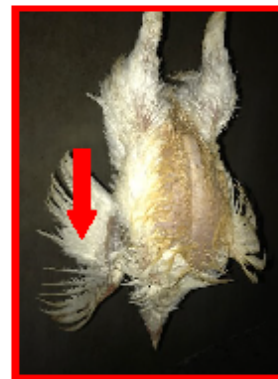
Fail (wing posture is not normal and wing hangs straight down (arrow) due to dislocation )

Note: Posture of the wings is the primary criteria for this portion of the audit. Birds with normal wing posture will have their wings tucked close to the body or may have wings slightly extended from the side of the breast. Both wing appearance and wing position should be evaluated for accuracy during the audit to determine if any broken or dislocated wings are present in the 500 bird sample being observed. Since wing damage can occur post-mortem due to wing contact with feather removal equipment, evaluate wings prior to feather removal for audit accuracy.