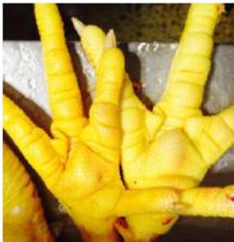
Pass (washed paws with no lesions & normal skin color)