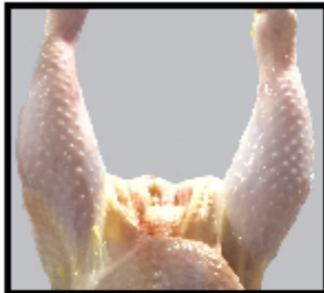
Pass (drumstick with normal skin color & no bruising)