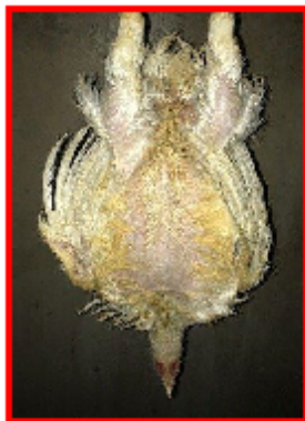
Pass (normal wing posture with wings tucked close to body)