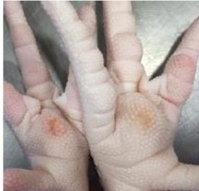
Pass (paws with no cuticle and normal skin color)