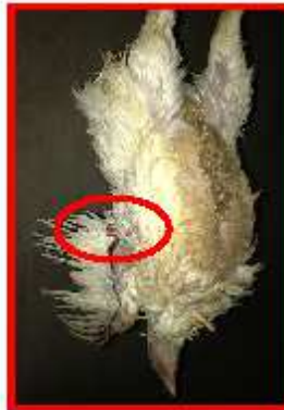
Fail (broken or dislocated bone is visible (circle); abnormal wing posture)