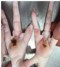
Pass (washed, post-scald paws with scab covering less than 1/2 the area of the foot pad)