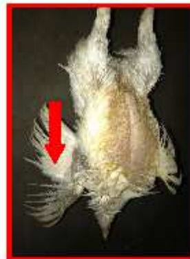
Fail (wing posture is not normal and wing hangs straight down (arrow) due to dislocation )

Note: Posture of the wings is the primary criteria for this portion of the audit . Birds with normal wing posture will have their wings tucked close to the body or may have wings slightly extended from the side of the breast. Both wing appearance and wing position should be evaluated for accuracy during the audit to determine if any broken or dislocated wings are present in the 500 bird sample being observed. Since wing damage can occur post-mortem due to wing contact with feather removal equipment, evaluate wings prior to feather removal for audit accuracy.