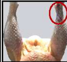
Fail (drumstick with bruise > quarter size)