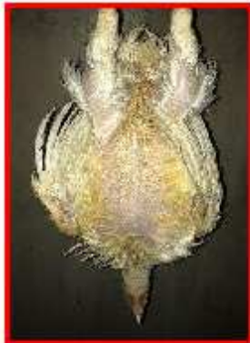
Pass (normal wing posture with wings tucked close to body)