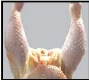
Pass (drumstick with normal skin color & no bruising)