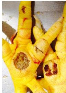
Fail (washed paws) Ulceration is present and lesion is more than 1/2 the area of the foot pad; lesions are also present on the toes