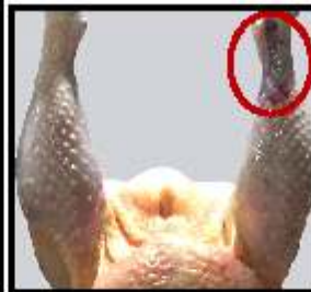
Fail (drumstick with bruise > quarter size)