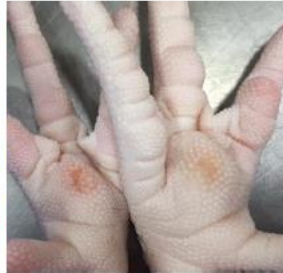
Pass (paws with no cuticle and normal skin color)