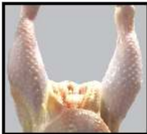
Pass (drumstick with normal skin color & no bruising)