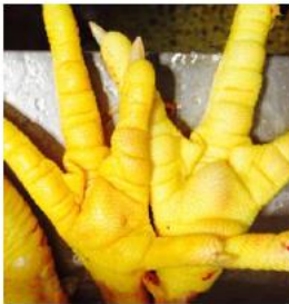
Pass (washed paws with no lesions & normal skin color)