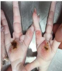
Pass (washed, post-scald paws with scab covering less than 1/2 the area of the foot pad)