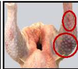
Fail (drumstick with various bruises covering > quarter size)

Note: If both legs are injured on one bird, this counts as one 'leg injury failure' for auditing purposes.