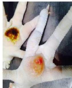
Fail (paws without cuticle) Ulceration is present and the lesion is more than 1/2 the area of the foot pad. Swelling of the foot pad is also visible.