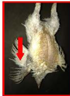
Fail (wing posture is not normal and wing hangs straight down (arrow) due to dislocation )

Note: Posture of the wings is the primary criteria for this portion of the audit . Birds with normal wing posture will have their wings tucked close to the body or may have wings slightly extended from the side of the breast. Both wing appearance and wing position should be evaluated for accuracy during the audit to determine if any broken or dislocated wings are present in the 500 bird sample being observed. Since wing damage can occur post-mortem due to wing contact with feather removal equipment, evaluate wings prior to feather removal for audit accuracy.