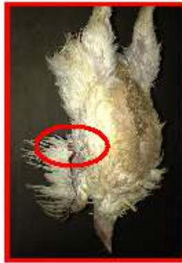
Fail (broken or dislocated bone is visible (circle); abnormal wing posture)