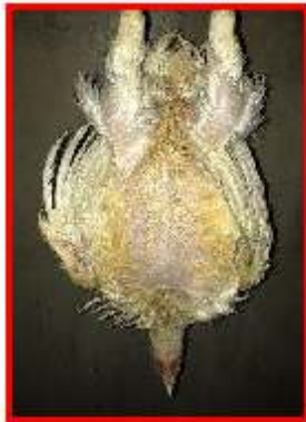
Pass (normal wing posture with wings tucked close to body)